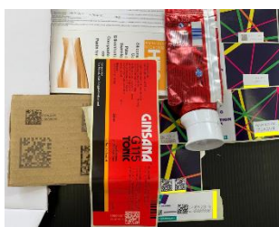
Labelling & Traceability

* Conditions unless otherwise stated: typical parameters at 25°C ambient temperature. * Reliability impacted if operating point deviates from reference condition